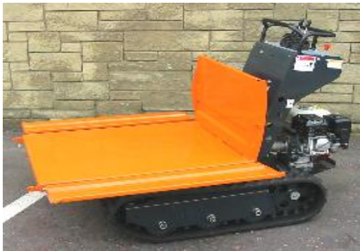
Agricultural body with drop sides.

The machine has very compact dimensions and is safe and stable to operate with excellent gradability and cross carriage stability.